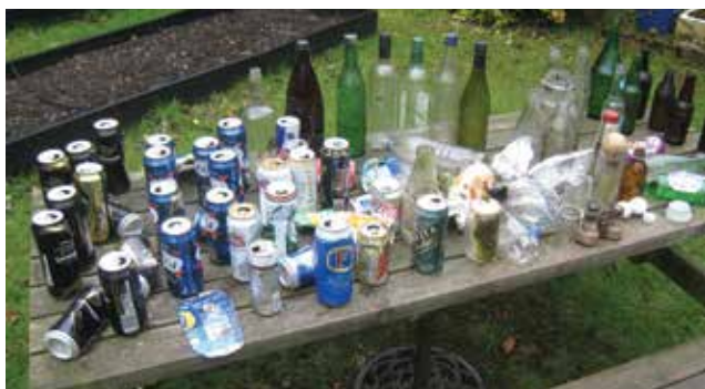
All this from ½ mile between the School and the Old Plough

And there were some more interesting items ... four bits of plastic car bumpers, a reflective strip from a cycle brake pedal – perhaps evidence of drivers'/riders' misjudgements on the 'Devil's Elbow'; a broken paint roller; a jemmy – perhaps related to the 'break-in' described below; a broken pair of opera glasses, suggesting that some litter throwers are more refined than we are inclined to believe; similarly an upmarket but broken blue and white Chinese-style teacup.