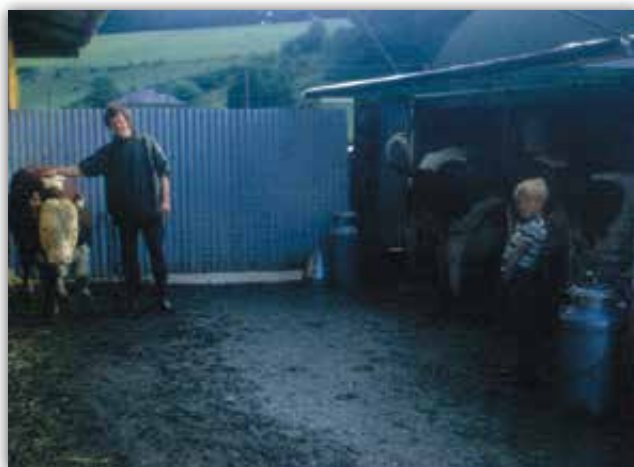
Working conditions on small dairy farm

New national farmer field schools are certainly not the answer as there are already many good institutions. Although the Bucks college at Stoke Mandeville no longer exists, the Berkshire College at Burchetts Green now has a thriving agricultural section again (having been closed down in 2003). Harper Adams College is now one of the top universities in the country. The truth is that young Brits are looking for managerial jobs in farming, when what is needed is someone to do the hard physical work.