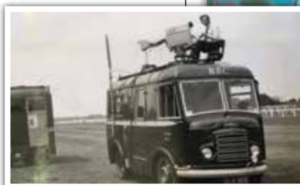
Stan in 1964 at Ascot Racecourse

The Outside Broadcast Department travelled out and about in various vehicles with all the necessary equipment to cover programmes, whether it be Play for Today, Z Cars, Seaside Special, Swap Shop or air displays.