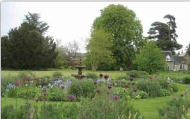
The gardens at Denman, the WI college in Oxfordshire

In August we were lucky to hold our Afternoon Tea in the Garden on a rare bright and sunny day. Tea and cakes, a plant stall and the sale of hand made cards all contributed to a profitable afternoon. The money raised will go to help the maintenance fund at Denman, the WI's own college. Many of our members enjoy short breaks there learning to cook, craft, improve their photography or IT skills or take part in a wide variety of other activities. One member recently attended a 'write your life story' course, so may find the publishing tips at the earlier meeting useful! Whatever your interest you will find a course to suit in this beautiful old house in its lovely garden setting.