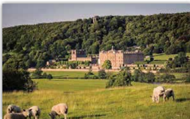
The Chatsworth Estate is 35,000 acres

are a magnificent feature of our countryside eg: The Chatsworth Estate).