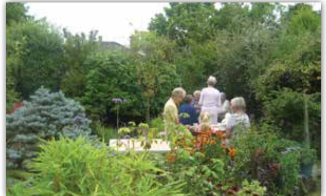
Speen WI members enjoy their Summer Garden Afternoon