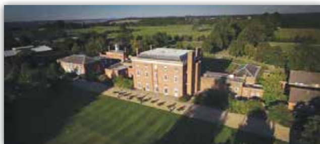
Berkshire College of Agriculture