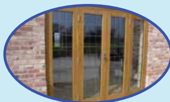
Bi-Fold Door Sets