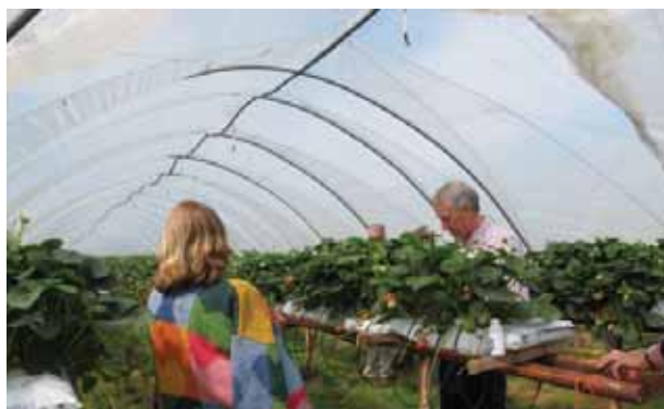
Strawberry growing in Kent

it as having 'hope value' being so near London. No farmer can buy land, whatever grade, with the idea of getting a return from 'farming' it.