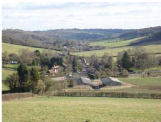
The poorest Chiltern land growing grass

Scientists have warned us that climate change would mean more extremes of weather and I think this year is proving them correct. After a very late spring, April was hotter than usual and May and June colder than usual. July was very hot and dry. These conditions, coupled with heavy infestations of numerous species of bugs, have resulted in poor growth for many crops.