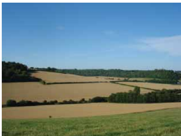
Better Chiltern land growing cereals

After the weather (and forgetting about diseases) the soil type is the biggest influence on crop yield. In East Anglia, due to the Grade 1 soil type in many locations, farmers have made their fortunes growing vegetables and cereals. Here in the Chilterns however, many of the soils are Grade 3 - and only suitable for growing grass. Even on the tops of the hills where there is a clay cap and in the valley bottoms, yields of cereals will be about 30% lower than those in East Anglia. From the economic point of view the cost of renting land is directly proportional to its fertility, but as you all know, in leafy Buckinghamshire the price of land to buy is artificially high because investors regard