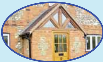
Doors and Porches

Ladymead Farm Estate Quainton, Nr Aylesbury Buckinghamshire HP22 4AN