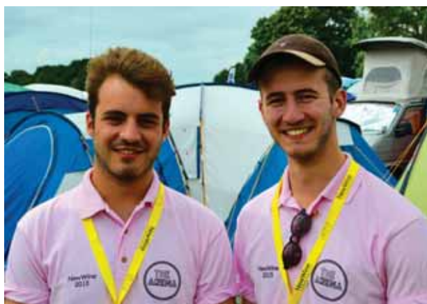
Serving on Team at New Wine