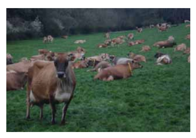
Cows relaxing on bank in North Dean

As you might guess, being a dairy farm, we have been hit hard by the average 20% drop in the price of milk. At last the government are taking some notice and have asked one of their many committees to look into the problem but few farmers have any confidence in the outcome. The current situation will force many smaller dairy farmers out of business, which is of course not in anybody's long term interests. All the supermarkets admit they are selling milk as a lost leader. This devalues milk as a product, but none of them are willing to be the first to raise the price to a realistic level.