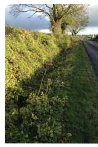
Old Man's Beard on Lacey Green to Princes Risborough road

Beard is rapidly becoming a worse problem than Japanese Knotweed and Himalayan Balsam. Cattle and sheep enjoy eating this Wild Clematis, and in doing so controlling its growth, but since grazing animals have largely disappeared from the fields, our hedgerows are being strangled; Clematis is very difficult to kill as it roots down wherever it touches the ground and it seems very resistant to the usual sprays. We would be delighted to hear from anyone who has a remedy.