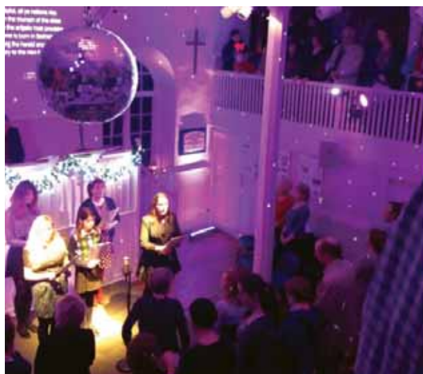
Full house for community carol service at the Chapel

We also held a reflective not-quite-midnight Christmas communion, which proved popular, while Christmas Day was noisy and definitely joyful.