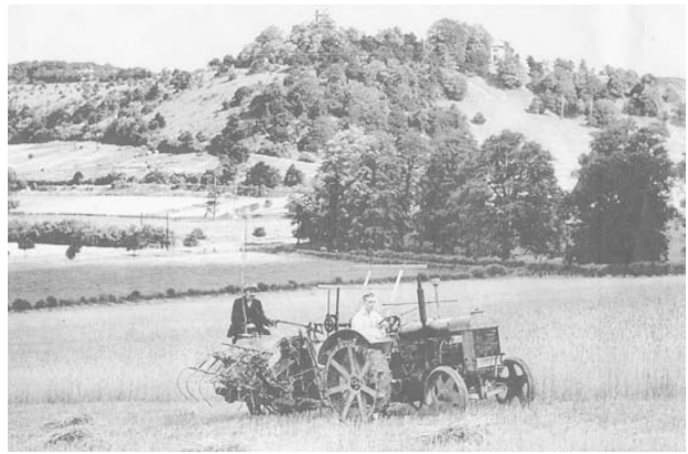
Harvesting at West Wycombe in the 1940s: note the thin crop; today's crops would yield 4-5 times as much grain

Buckinghamshire has a plethora of footpaths which are well used by people and dogs, so putting animals into the fields always has the potential to