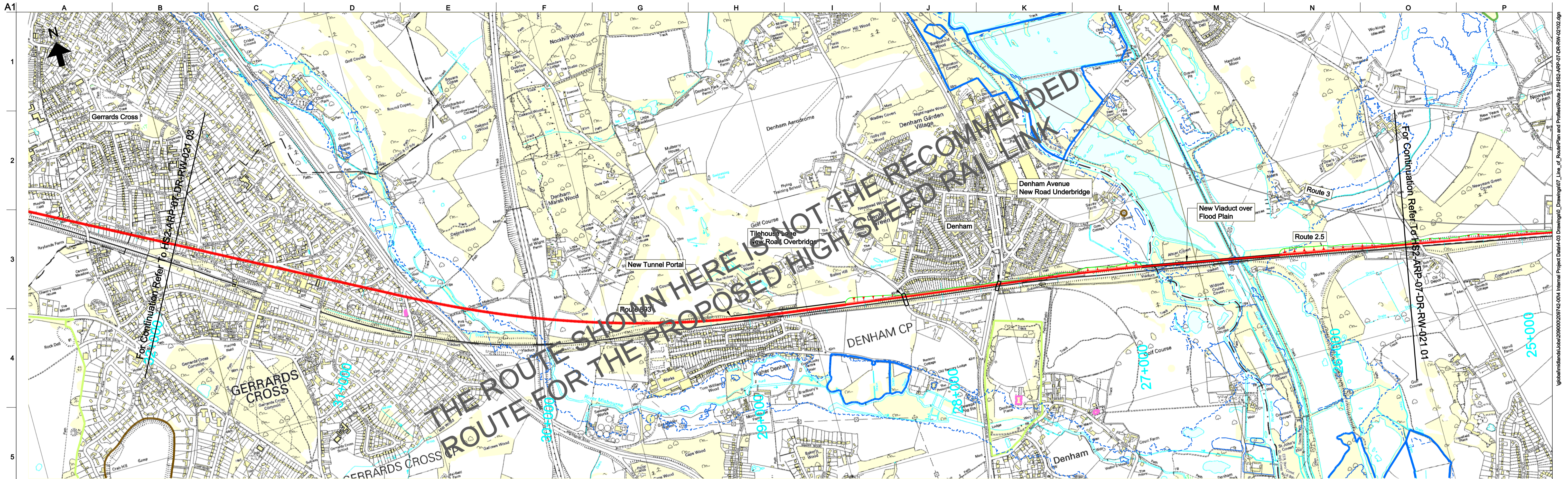
Plan Scale 1:10000